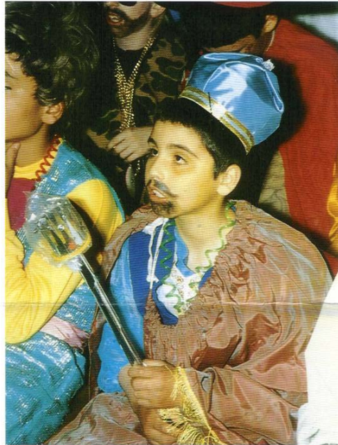
Carnival atmosphere as students dress up in costume for Purim festivities