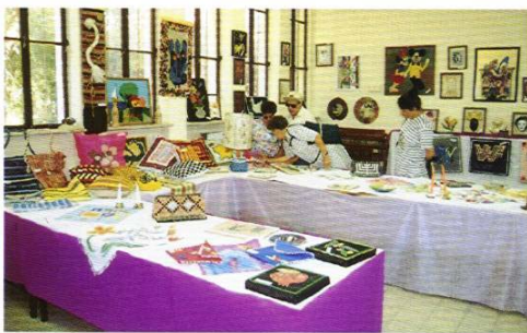
Colorful arts and craft exhibit of students work in art classroom