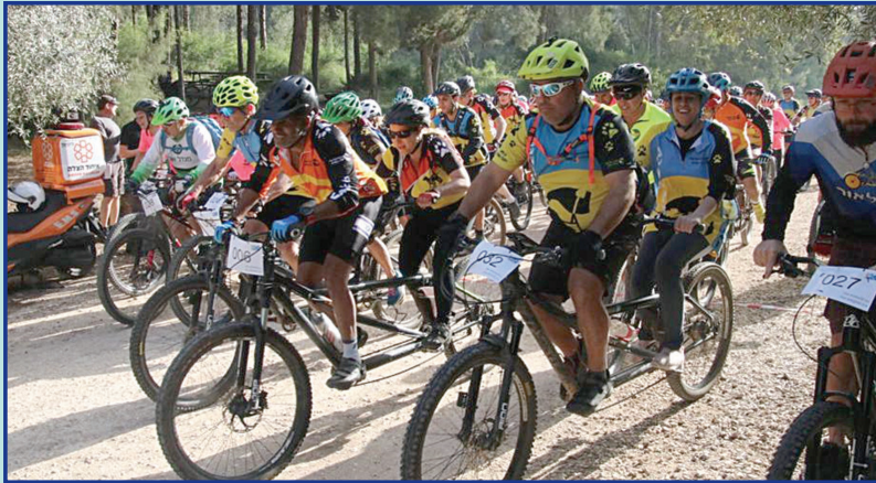
Tandem bikers at the starting line

❁ A three-day tandem bike ride took place this spring as dozens of couples (including a sighted rider teamed with a blind rider) biked from Netanya on the Mediterranean coast to the Institute in Jerusalem.